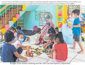
Budget 2024 assists working women with tax exemptions, expanded childcare allowances, over RM40 million for kindergartens, nurseries and pre-schools (pic: MEDIA MALAYSIA)