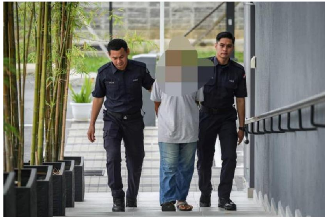
Tertuduh ketika dibawa ke Mahkamah Sesyen hari ini.