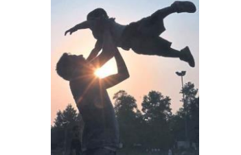
Men who become fathers experience higher salaries and leadership opportunities due to their perceived responsibility and financial motivation