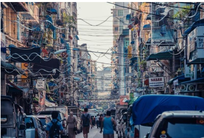
Trafficking for forced criminality refers to the exploitation of individuals through coercion, force, or deception to compel them into criminal activities for the financial gain or benefit of traffickers.