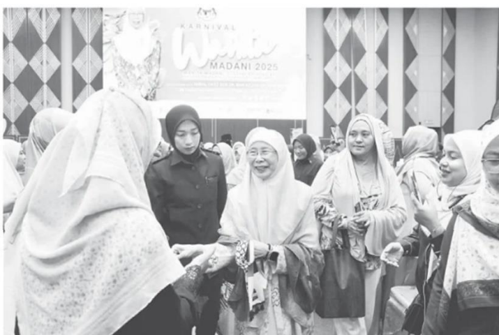
MESRA: Wan Azizah (tengah) beramah mesra bersama tetamu yang hadir pada Majlis Perasmian Karnival Wanita MADANI 2025 di Putrajaya semalam.

“Ingatlah, peranan dan tanggungjawab sebagai seorang ibu perlu sentiasa diutamakan walau sesibuk manapun kita bekerja,” katanya kepada media selepas majlis perasmian Karnival Wanita MADANI 2025, di sini semalam yang turut dihadiri Menteri di Jabatan Perdana Menteri (Hal Ehwal Agama) Datuk Dr Mohd Na'im Mokhtar.