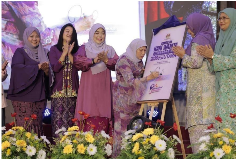
NANCY Shukri merasmikan Sambutan Hari Wanita Antarabangsa 2025 peringkat Zon Utara di Ipoh, Perak.