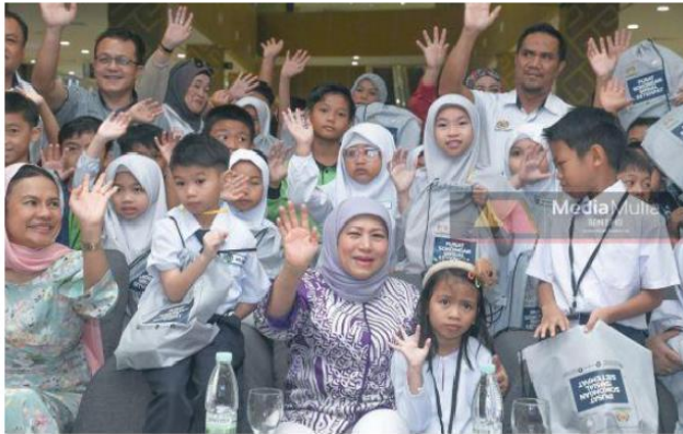
NANCY Shukri bersama sebahagian pelajar yang menerima sumbangan Kembali ke Sekolah yang diadakan Kuching baru-baru ini.

Menteri Pembangunan Wanita, Keluarga dan Masyarakat Datuk Nancy Shukri , baru-baru ini menyampaikan sumbangan Kembali ke Sekolah kepada 460 murid dari Kuching dan Padawan, Sarawak.