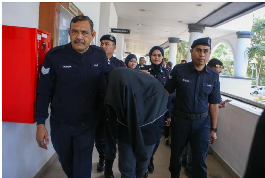
ANGGOTA polis mengawal tertuduh yang berhadapan pendakwaan melakukan amang seksual fizikal di Mahkamah Sesyen Alor Setar, hari ini.