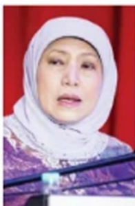
Datuk Seri Nancy Shukri

"We talk about this issue every day, yet it still happens. We urge those who receive the video or were at the scene not to share it, as the victim is already traumatised by the incident," she told a press conference after