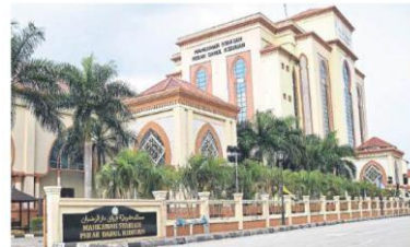
Oppressed women can file for 'fasakh' or 'khuluq' through the Shariah court.

"This hadith clearly shows that Islam prohibits all forms of violence against wives and instead promotes kind treatment," he said.