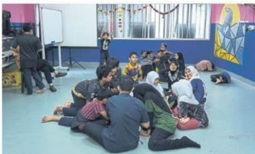
Under Islamic law, child custody or 'hadanah' prioritises the welfare of the children

"If the husband continues his abusive behaviour, the wife has the right to request the judge to take appropriate action against him," he said.