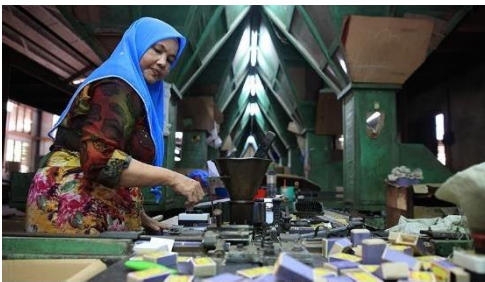
Unemployed women must prepare themselves by acquiring skills to achieve financial independence.

Islamic law allows a wife to leave an abusive marriage for self-protection, as an abusive husband violates his duties as the family leader