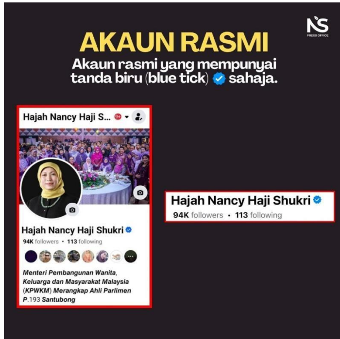
Official Facebook account of the Women, Family and Community Development Minister.

News Desk Sarawak News, Top Story 13 March 2025 9 minutes ago