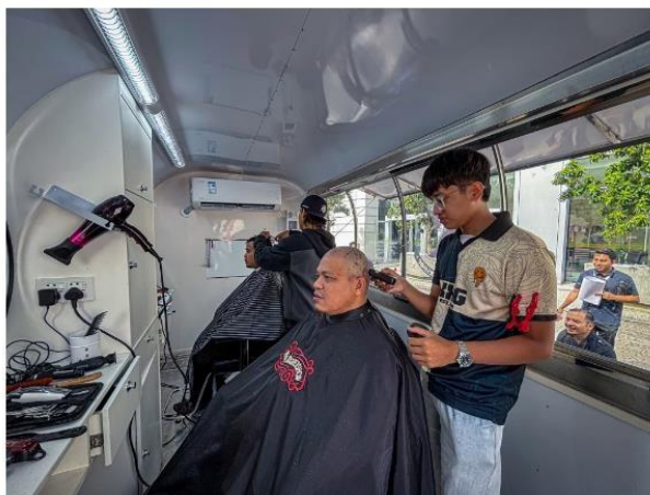
Perkhidmatan wagon kiosk gunting rambut yang dikendalikan oleh anak-anak di bawah program Anjung Sinar.

Faham dengan situasi ini, Yayasan Kebajikan Negara (YKN) dengan penuh rasa tanggungjawab membawakan acara Wagon Kiosk Kasih YKN khas buat warga Kementerian Pembangunan Wanita, Keluarga dan Masyarakat (KPWKM).