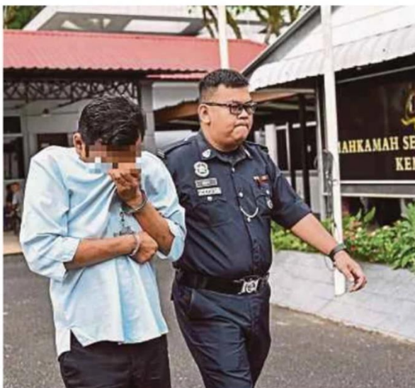
The accused, a lecturer at a skills training institute in Kemaman, Terengganu, being taken to the magistrate’s court for a remand order yesterday.