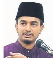
According to Khairul Azhar, domestic violence contradicts the principles of Islam.

"Unemployed wives can also claim assets based on their contributions during the marriage, such as household management and other forms of support," he said.