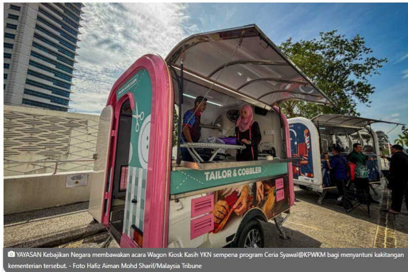
YAYASAN Kebajikan Negara membawakan acara Wagon Kiosk Kasih YKN sempena program Ceria Syawal@KPWKM bagi menyantuni kakitangan kementerian tersebut.