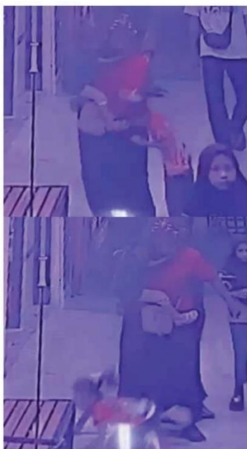
RAKAMAN CCTV memaparkan tindakan seorang wanita memukul anaknya hingga terhantuk di bucu bangku di sebuah pasar raya di Arau, kelmarin.