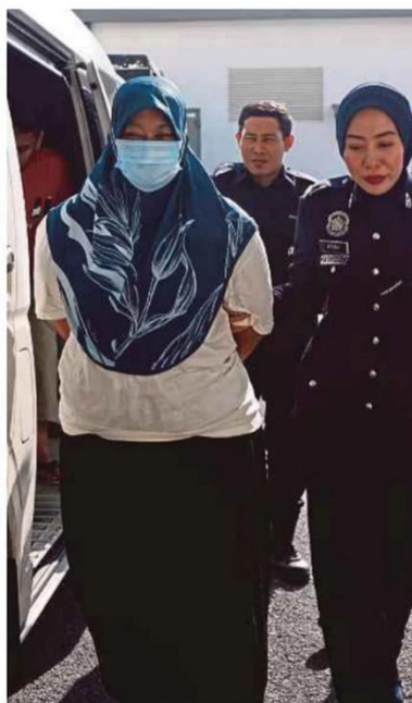
SUSPEK dibawa pihak polis ke kompleks Mahkamah Kangar, semalam sebelum majistret mengeluarkan perintah reman selama enam hari ke atasnya.