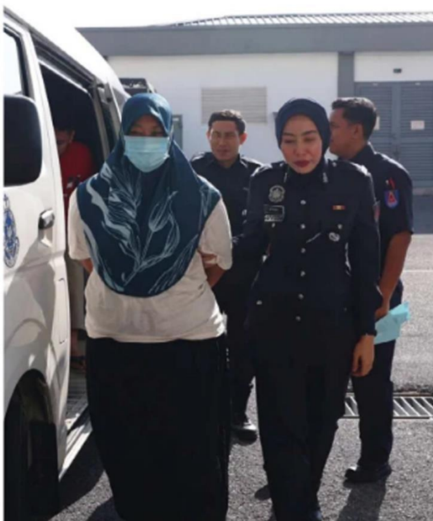
The suspect being brought to the court for the remand application hearing.

He added that the woman has a husband who is also a canteen worker, and another daughter aged two years. The 47-second video went viral on social media on Monday. — Bernama