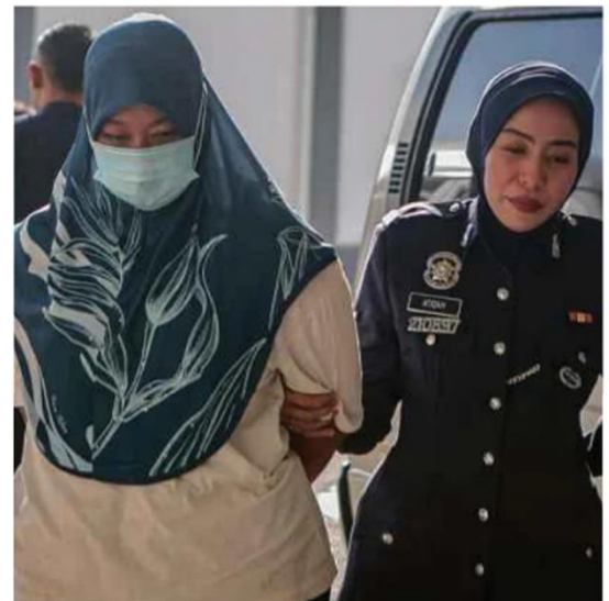
Polis membawa wanita yang didakwa memukul anaknya di hadapan pasar raya di Jejawi untuk mendapatkan perintah reman di Kompleks Mahkamah Kangar, semalam.

"Selain mangsa, suspek mempunyai seorang lagi anak perempuan berusia dua tahun," katanya. Kes disiasat mengikut Sek-