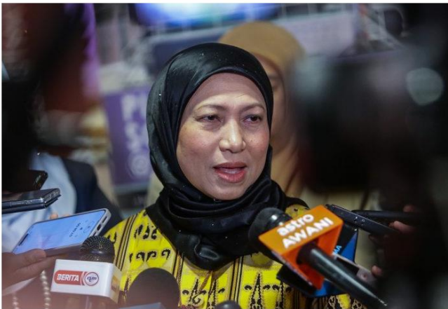
Menteri Pembangunan Wanita, Keluarga dan Masyarakat, Datuk Seri Nancy Shukri