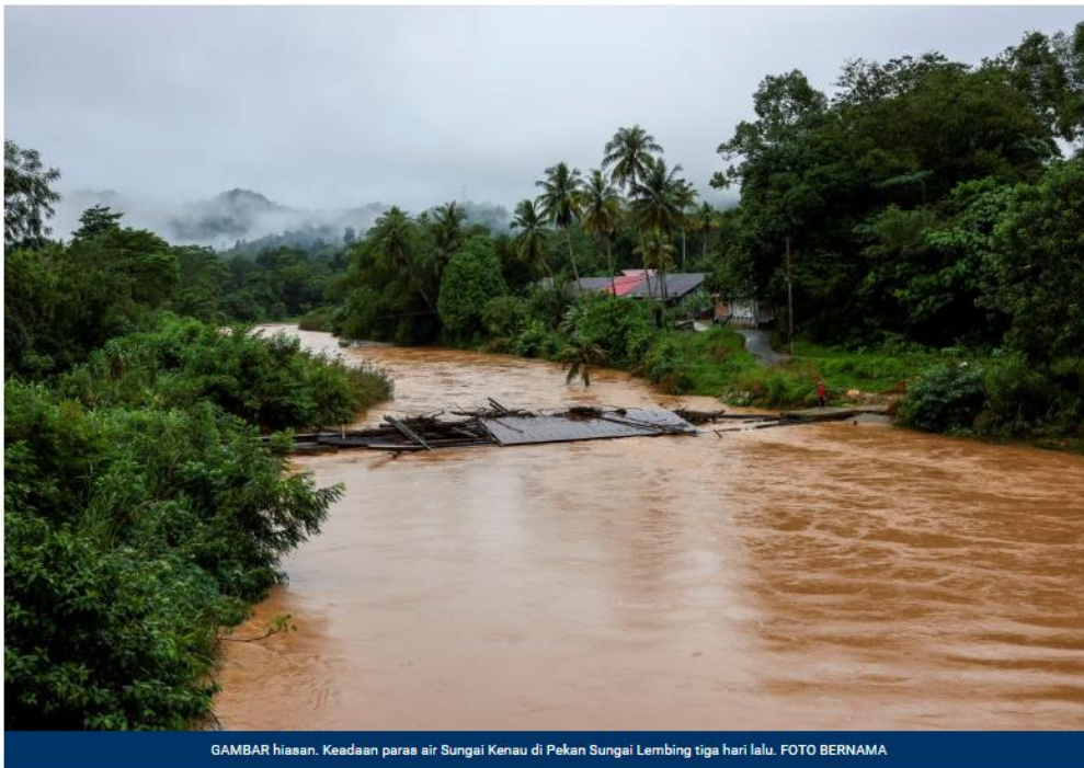
GAMBAR hiasan. Keadaan paras air Sungai Kenau di Pekan Sungai Lembing tiga hari lalu.

Kuala Lumpur: Situasi banjir di Terengganu pulih sepenuhnya apabila pusat pemindahan sementara (PPS) terakhir di Kemaman ditutup pada 2.30 petang tadi, manakala jumlah mangsa banjir di Perak, Pahang dan Johor tidak banyak berubah setakat petang ini.