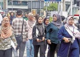
Back to work: Most women are returning to work to help ease the burden of rising cost of everything, but they are also looking for stability and flexibility from employers.