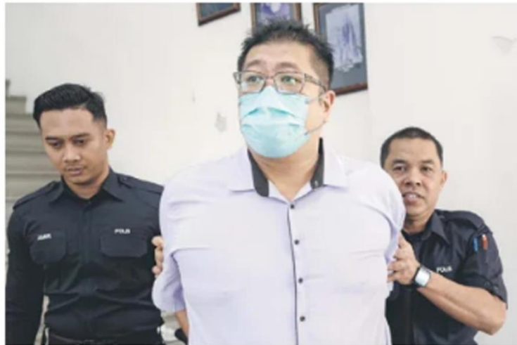
Teh is escorted by police at the court.