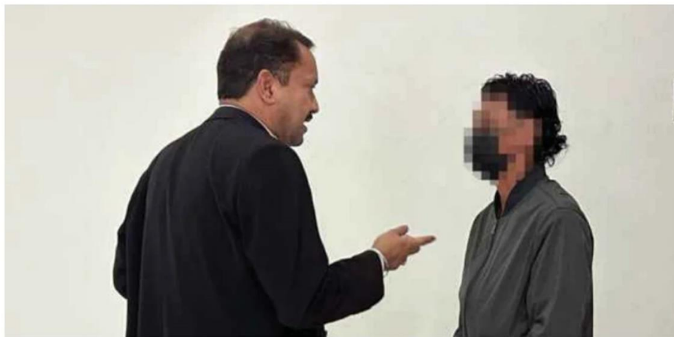
TERTUDUH (kanan) didakwa merogol anak tirinya berusia 12 tahun ketika kejadian di sebuah rumah di Simpang Renggam pada 8 Ogos 2022.