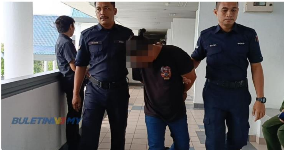
Lelaki dituduh rogol remaja perempuan dan lakukan amang seksual fizikal tanpa kerelaan mangsa, bulan lalu- FOTO NTSP

AYER KEROH: Seorang pengutip besi dituduh Mahkamah Sesyen di sini, hari ini, atas pertuduhan merogol dan melakukan amang seksual fizikal terhadap remaja perempuan bulan lalu.