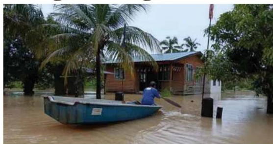
SEORANG penduduk Kampung Gudang Rasau, Kuantan menaiki bot untuk memindahkan barang.

buh, Maran dan Sungai Kenau di sini, Sungai Tanum di Jambatan Chegar Perah, Lipis; Sungai tembeling di Kampung Mer-