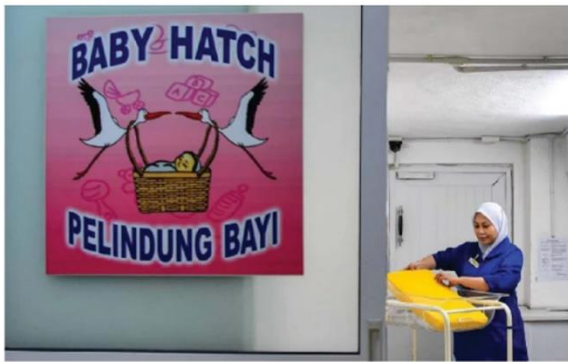
The baby hatch facility is equipped with detection systems, which alert the staff immediately when a baby is placed inside.