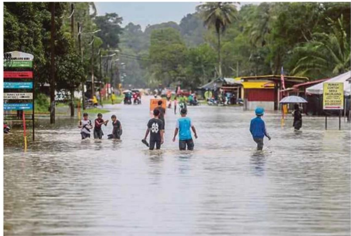
People wading through floodwaters in Kampung Baru Kemasik, Kemaman, yesterday.