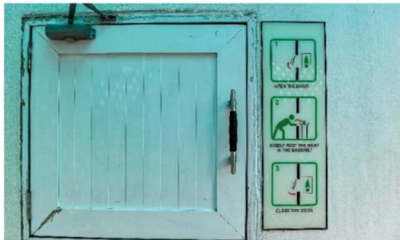
A baby hatch is a special place where mothers who are unable to provide for themselves can leave their babies in privacy and safety.

According to Nor Aidil Ikram, the babies that are rescued