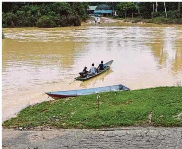
The bridge linking Tanjung Kala and Pasir Jering in Kuala Krai is submerged after heavy rainfall yesterday.

Dewan Semai Bakti Felda Chiku 7 is accommodating 125 people from 30 families.