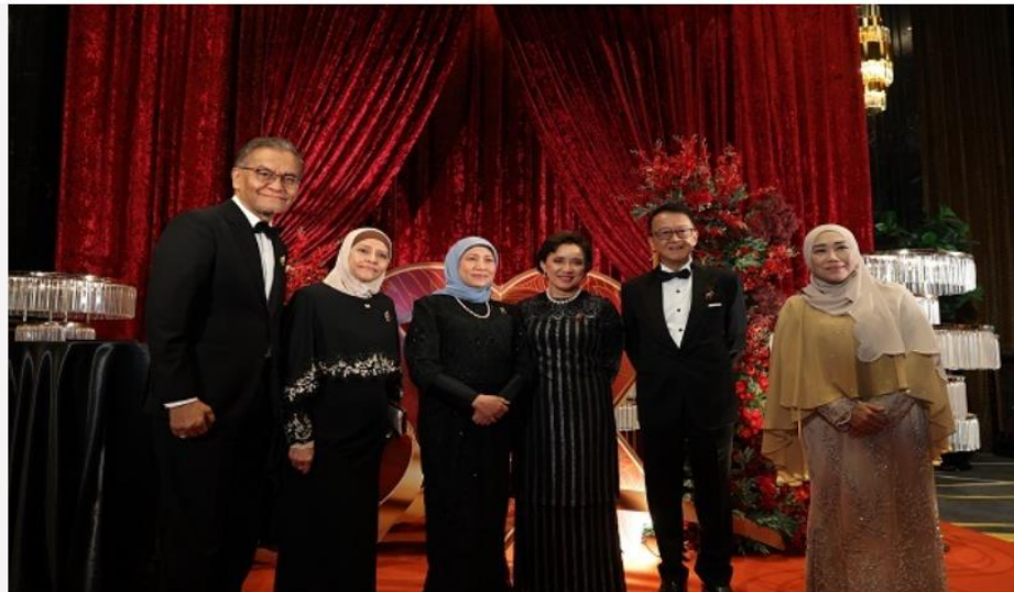
Yayasan AIDS Malaysia Photo

Highlights - Dicipta: 10 Disember 2024 02:18 PM - Kemas kini: 10 Disember 2024 02:22 PM