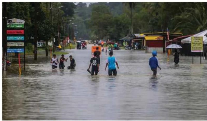
Kemaman jadi daerah pertama di Terengganu dilanda banjir gelombang kedua, semalam.