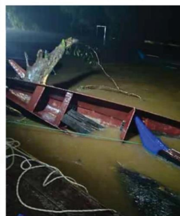
DUA perahu antara yang tenggelam bersama enjin akibat kepala air di Sungai Tembeling berdekatan Kuala Tahau, Jerantut.

"Perahu, enjin dan peralatan berkenaan yang tenggelam kemudian diangkat semula ke darat. Enjin bot yang diselamatkan bagaimanapun perlu dihantar untuk dibaiki berikutan dimasukinya air sungai," katanya.