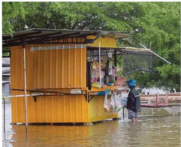
A man buying goods from a stall that is still open despite the floods in Kampung Baru Kemasik, Kemaman, yesterday.