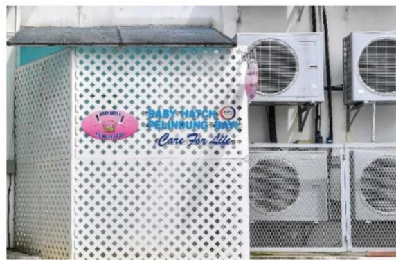
Among the baby hatch rooms available at KPJ Seremban.