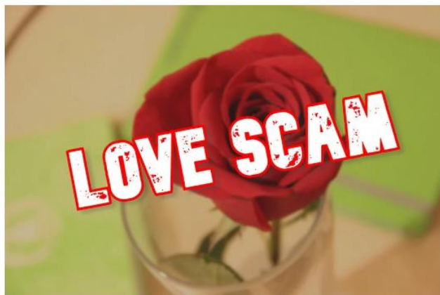
Media sosial juga digunakan oleh pedofilia untuk menyebarkan bahan penganiayaan seksual kanak-kanak.

"Mereka (kanak-kanak) perlu faham apa yang menjadi ancaman kepada diri mereka dan bagaimana untuk mempertahankan dan melindungi diri," kata beliau. - BERNAMA