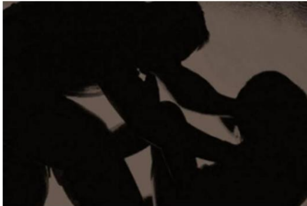
Mangsa rogol bawah umur mengenali pelaku melalui laman sosial.

KUALA LUMPUR: Kes jenayah rogol membabitkan gadis bawah umur meningkat ketara dalam tempoh tiga tahun lalu dan polis percaya, kebanyakannya bermula daripada pengantunan (pujukan) melalui media sosial termasuk aplikasi sembang seperti WhatsApp.