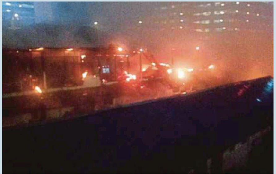
Kebakaran membabitkan tiga bangunan rumah kedai di Jalan Senyum, Kampung Wadi Hana, Johor Bahru, semalam.