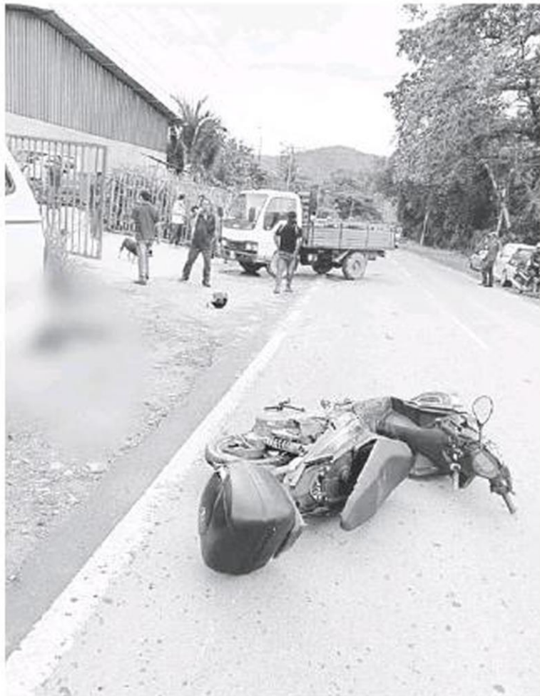
NAHAS: Keadaan kemalangan di lokasi kejadian.

Beliau berkata, kemalangan itu mengakibatkan penunggang dan pembonceng terbabas ke arah kanan sebelum terlanggar bahagian