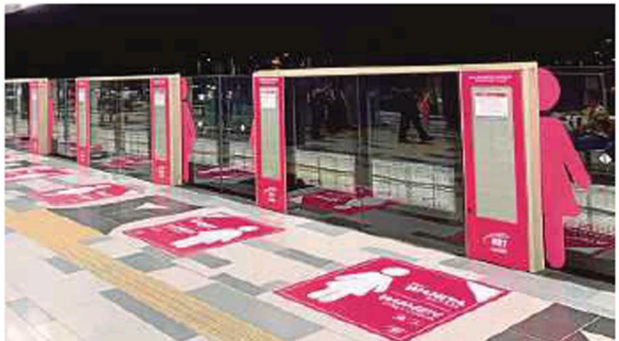
Having women-only coaches causes a capacity problem, but women should not be blamed for this. FILE PIC

tive comments come from young men, as they may not be able to imagine the fear and anxiety women experience in certain situations.